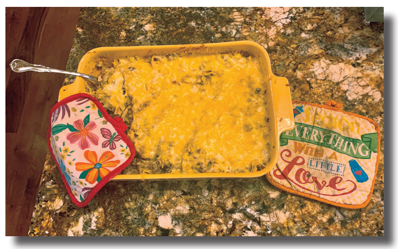
Hot, hearty, and ready to eat!