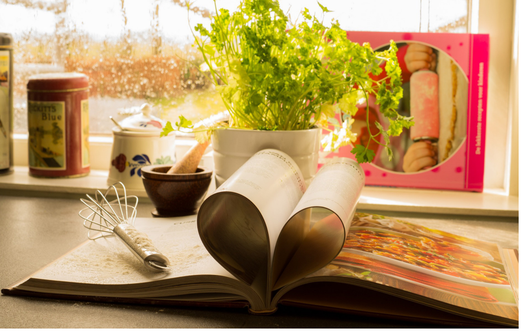
There is just something special about a good family recipe.

Many recipes evoke memories of cooking and/or eating with beloved friends and family. Some bring to mind the scents and tastes of holidays past, others remind us of the fun we had cooking with our parents, grandparents, or our own children.